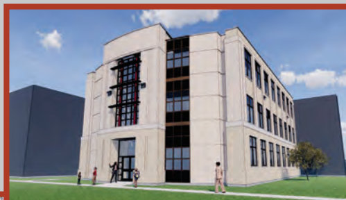
MIDDLE SCHOOL CURTAIN WALL