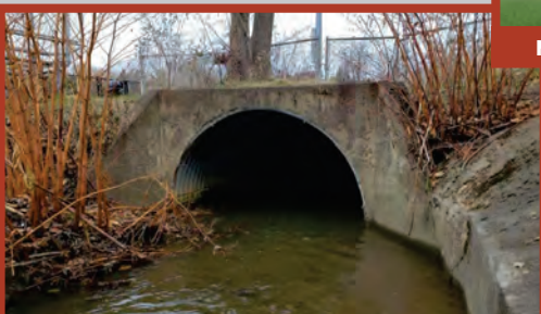
HIGH SCHOOL CULVERT